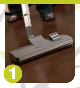
Sweep or vacuum to remove dust and abrasive dirt. The wheels of the vacuum cleaner should be in good condition, and its cleaning accessories must be free of all abrasive particles that could scratch the finish.

To ensure a durable finish and a beautiful Mirage hardwood floor, follow these quick and easy maintenance tips.