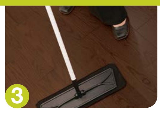
Swiftly wipe the floor surface with the mop, using a to-and-fro motion across the length of the floorboards. Finish cleaning one section before starting on a new area of the floor.