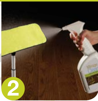
Lightly spray the cleaner on the mop cover.